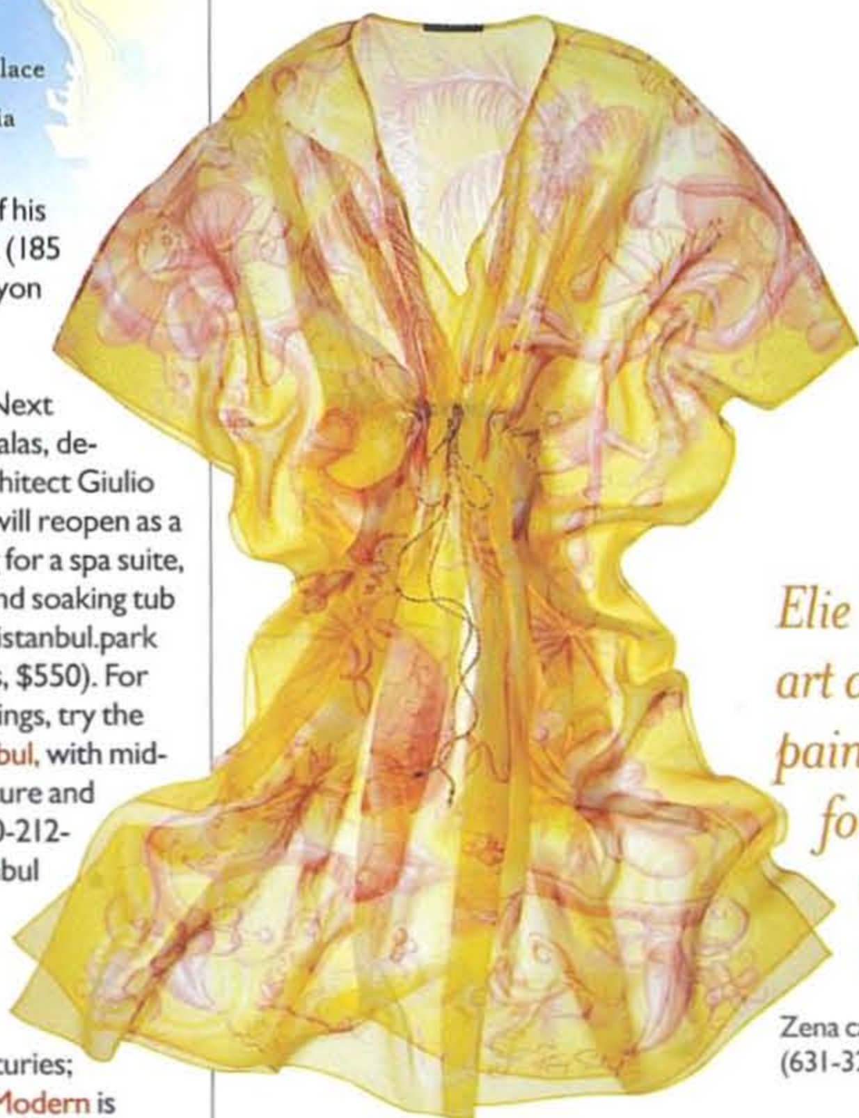
Zena caftan, $248 (631-329-8883).

Due out August 29, it's an ode to the city as much as to love and lust: Look for Gaudí architecture, including Sagrada Família, a favorite of Allen's. The cast stayed at the Hotel Arts (34-93-221-1000; ritzcarlton.com ; doubles, $460–$720); Allen dined at Ca L'Isidre —“it has the best food in Europe” (12 C. Les Flors; 34-93-441-1139; entrées, $30–$60) and spent downtime playing jazz at the Hotel Casa Fuster's bar (34-93-255-3000; casafuster.com ).