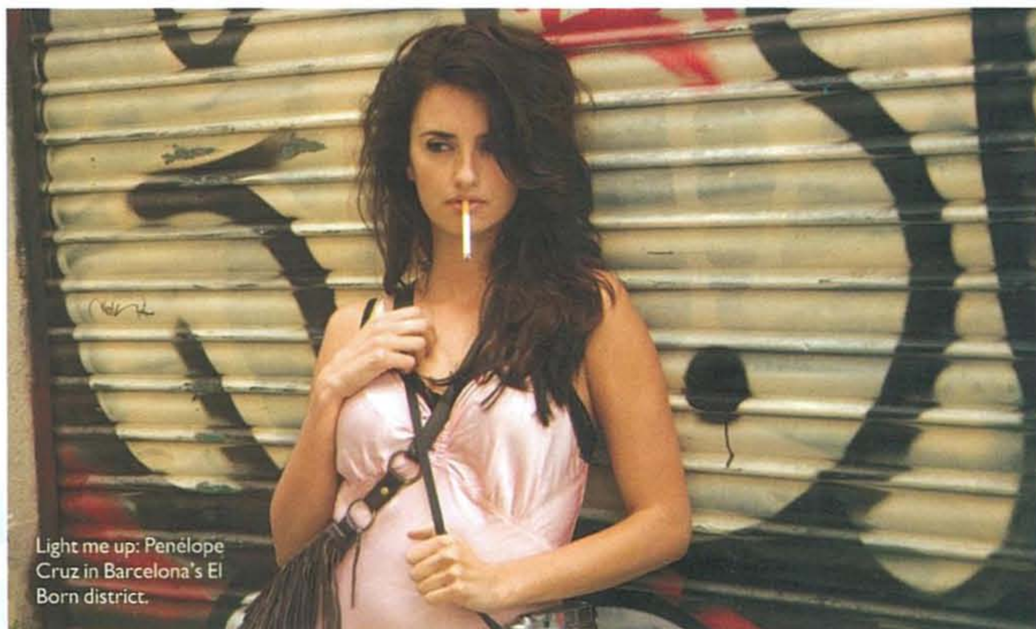
Light me up: Penélope Cruz in Barcelona's El Born district.

kasan , an outpost of his London restaurant (185 Büyükdere St., Kanyon Shopping Ctr.; 90-212-319-8888; entrées, $32–$105). Next month the Maçka Palas, designed by Italian architect Giulio Mongheri in 1922, will reopen as a Park Hyatt —spring for a spa suite, with steam room and soaking tub (90-212-368-1234; istanbul.park.hyatt.com ; doubles, $550). For more intimate lodgings, try the 15-room Wittistanbul , with mid-century-style furniture and marble kitchens (90-212-393-7900; wittistanbul.com ; doubles, $410–$455). Istanbul has been a world center for Islamic arts for centuries; today the Istanbul Modern is one of Europe's key contemporary museums—check out “Modern Experiences,” paintings from the nineteenth and twentieth centuries (90-212-334-7300; istanbulmodern.org ). It may be a case of in with the new in Europe's most populous city, but don't forget the old: Make sure icons like Hagia Sophia and Topkapi Palace are part of your itinerary.